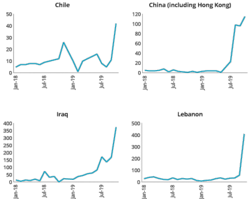
Incidents of civil unrest in six countries (January 2018 to October 2019)